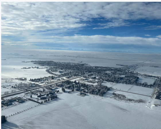
The Town of Three Hills